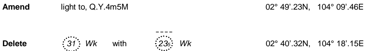
Chart MAL 6257 (Last Correction 200/2015) WGS 84 DATUM